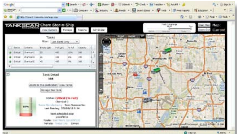
View critical tanks and locations on one screen.

The TankScan Global software is a web based solution allowing access to tank level data anywhere there is internet access. View accurate tank levels, send configuration updates, manage set points, receive text or email alarms, as well as view/graph data history-all from the comfort of your own desk. The data is sent to a cloud based data base by either Ethernet, cellular or satellite and can be shared with all levels of the distribution channel. TankScan Global is also available with an optional fleet management solution that allows for optimization for truck routes and ability to minimize the cost of delivery.